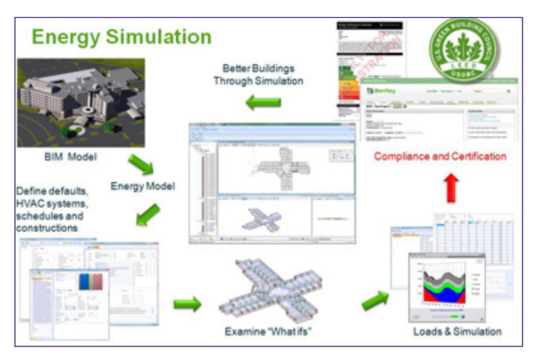
AECOsim Energy Simulator workflow

The interface has a ribbon bar menu system, putting multiple layers of options at user's fingertips. The project tree allows easy visual navigation of the building spaces, walls, windows, doors, ceilings, roofs, and HVAC components. Data managers provide easy access to extensive databases of materials, weather data, HVAC systems, space types, and other information. Users can customize the existing datasets or import their own. The HVAC Designer makes it easy to configure HVAC components and systems using a visual drag and drop system.